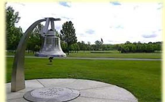
Bell from the USS Saratoga, Gerald B. H. Solomon National Cemetery