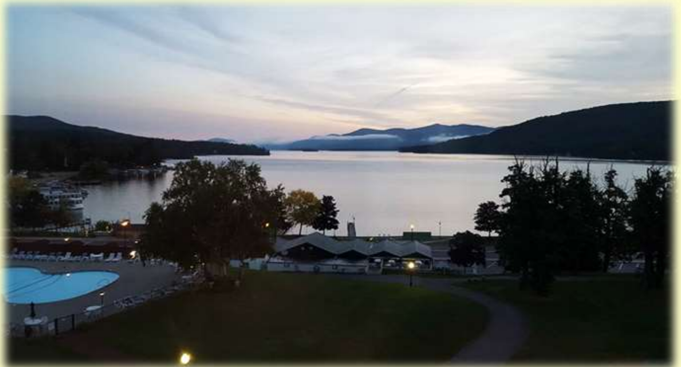
Morning on Lake George from the Fort William Henry Hotel

Sadly, hurricanes ravaged the southern US and the Caribbean leaving destruction and misery in their path. We New Yorkers were extremely fortunate this season. And the weather in Lake George for the entire time of the convention was ... perfect! One could not ask for better weather – sunny and quite warm, but not beastly hot. For those of you unable to make it to the convention, here is a brief synopsis of the key events: