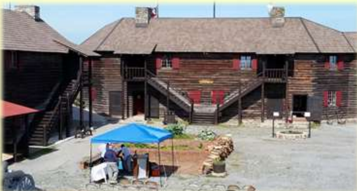
Preparing for the Memorial Service inside Fort William Henry