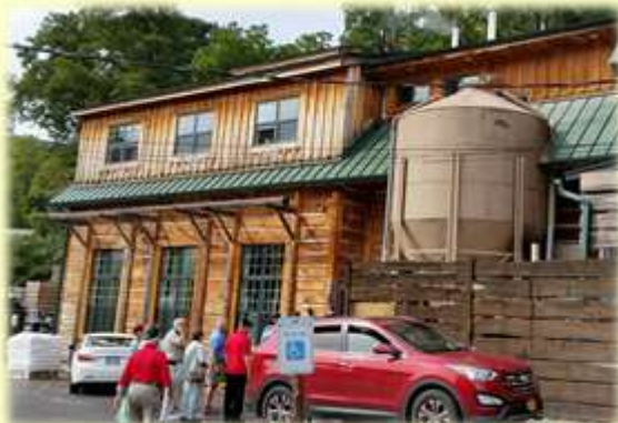
The Adirondack Brewery