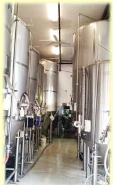
Inside the Adirondack Brewery: What's in those vats??!