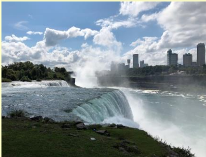
View of American Falls & Niagara Falls, Canada / American Falls / American Falls w/rainbow & Peace Bridge