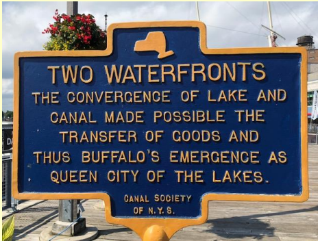
Terminus of the Erie Canal / PT boat restoration project