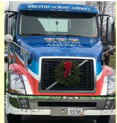
Pictured above, the side of the trailer and cab of the truck that transported the wreaths from Maine to Saratoga.