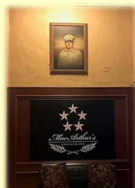
Images of West Point (clockwise from upper left): Cadet Chapel entrance; Cadet Chapel interior; "Stormin' Norman's" grave; view up the Hudson from Trophy Point; the MacArthur Room, Thayer Hotel; The Plain; Civil War battle monument at Trophy Point

After lunch, the tour bus then took the group back across the Hudson and north to the Franklin Delano Roosevelt National Park Site at Hyde Park . The park museum featured an awesome D-day/WWII commemorative exhibit with many declassified historical documents and photos on display. Some group members also toured the Roosevelt home.