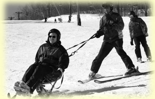
Above: Snowfest 2014

On March 7, five members of our Chapter and their spouses attended STRIDE Adaptive Sports' welcome ceremony at Troy Hilton Garden Inn for their annual Wounded Warrior Snowfest. The Snowfest brings selected veterans wounded and/or disabled in combat, and their loved ones, for a weekend at Jiminy Peak to learn how to overcome their disabilities and enjoy skiing, snowboarding and winter fun. The intent is to build their confidence and give them hope by helping them to focus on what they CAN do rather than on what they cannot do.