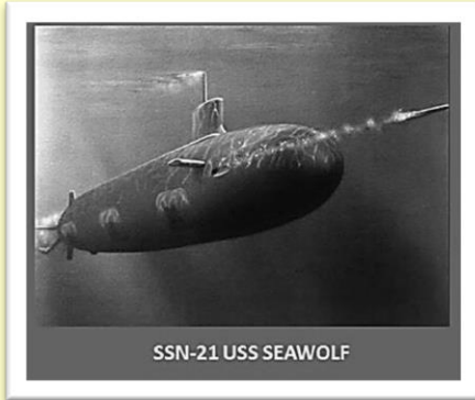
SSN-21 USS SEAWOLF

NEXT GENERAL MEMBERSHIP MEETING – SATURDAY JUNE 11 , 1300 - 1600 hours at the Edison Club, Rexford, NY [The luncheon reservation form is on page 5.]