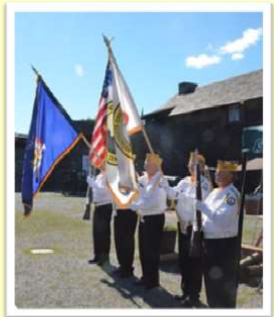
Honor Guard at the NYS Council of Chapters Memorial Service, September 15, Fort William Henry