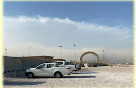
An incoming sandstorm

Al Udeid Airbase is located just outside Doha, Qatar and the base houses thousands of troops either stationed there or transiting to other points within the CENTCOM AOR. The weather was hot and humid with some days getting to 116 degrees and nights at 100 plus.