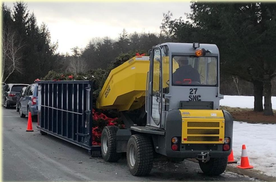
Left: Loading wreaths into the dumpster;