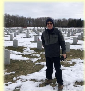
Below: Frozen Al