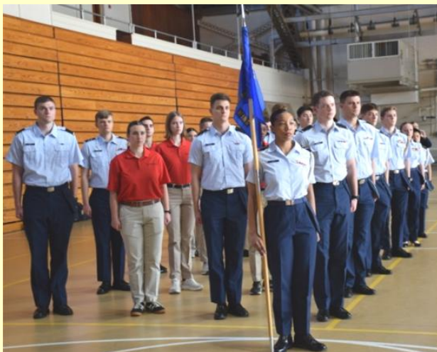
Above: Det 550's Cadet Corps Wing prepares for the Change of Command ceremony in the RPI Armory.